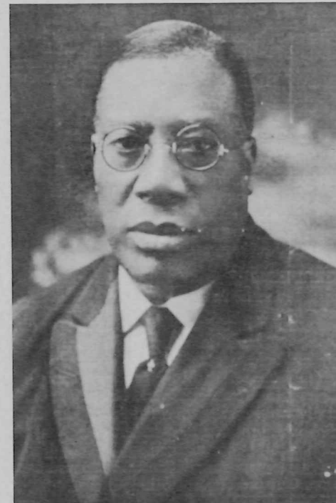
CHARLES A. TINDLEY: METHODIST PREACHER