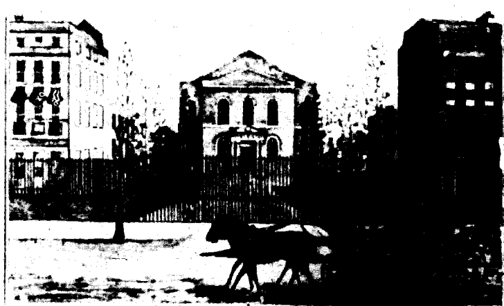
Wesley's Chapel in 1821.

Chapel. He was assisted by three ordained Anglican ministers. At first no layman--no preacher not especially ordained--was allowed to officiate within the Chapel except on weekdays. Finally, at the insistence of the trustees of the Chapel, this rule was relaxed.